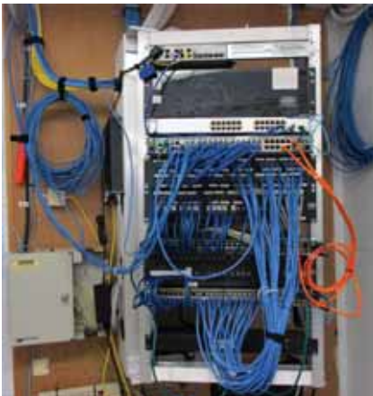
Antiquated network infrastructure at Deerfield Elem.