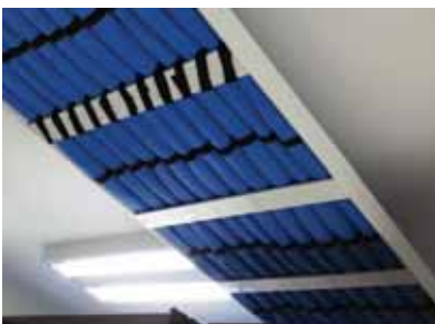
Example of modern network cabling