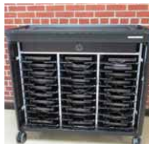
30-unit Laptop Cart