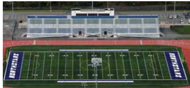
HS Turf Field Example