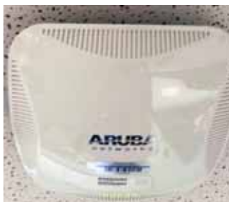
Wireless Access Point (one recommended per instructional space for student access)