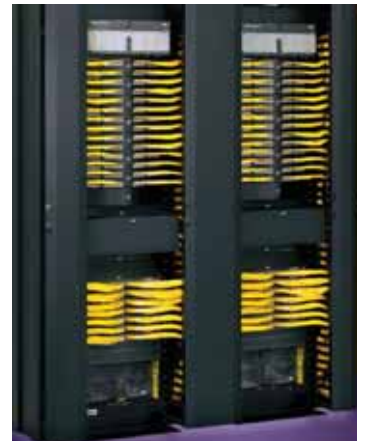
Example of modern network racks