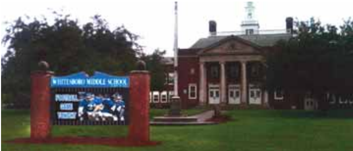
Electronic sign at MS

The meeting will be held in the Board of Education Room in the Parkway School.