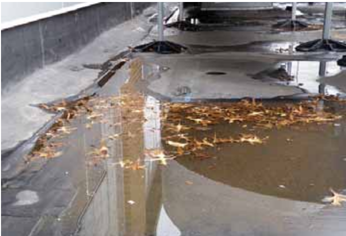
Westmoreland Road Elementary Roof

*STAR Savings may be limited by the MAXIMUM STAR Savings