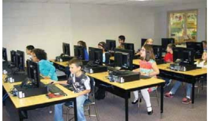
Students using a computer lab.