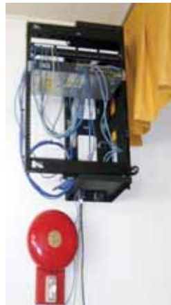
Antiquated network infrastructure at Westmoreland Rd.