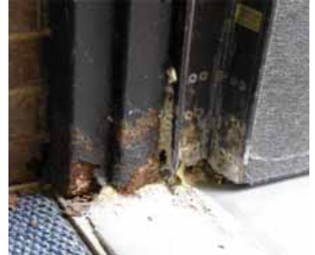
HS Door Frames