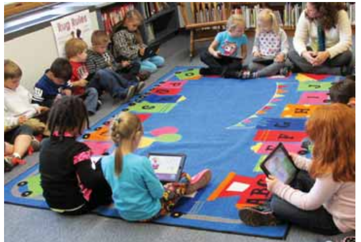
Students using iPads.