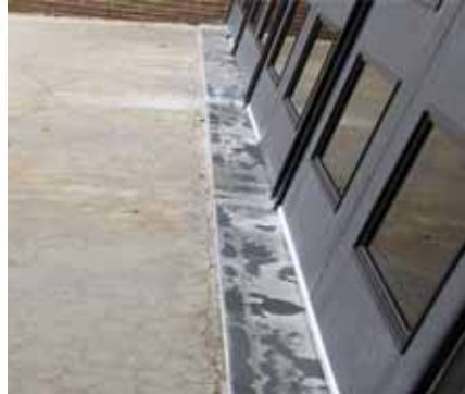
HS Auditorium Entrance