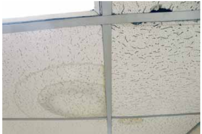
Westmoreland Road Elementary Ceiling Tiles