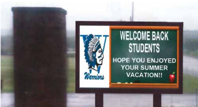
Electronic sign at HS