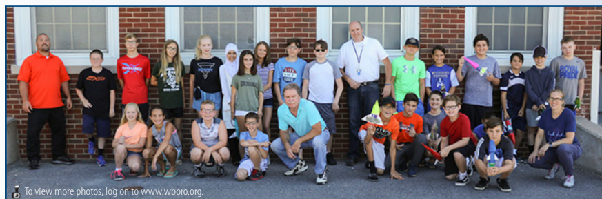
To view more photos, log on to www.wboro.org .